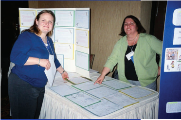
Richard Stockton College of NJ MAED Graduate Students