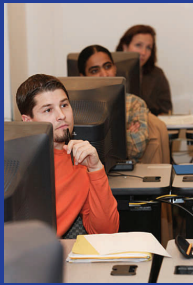
Richard Stockton College of NJ MAED Graduate Students