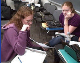
Richard Stockton College of NJ MAED Graduate Students