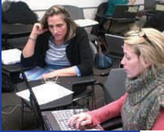
Richard Stockton College of NJ MAED Graduate Students