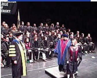
Richard Stockton College of NJ MAED Graduates Spring 2009