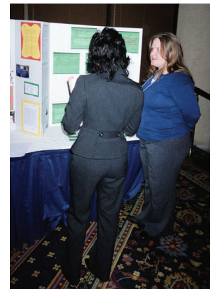
Richard Stockton College of NJ MAED Graduate Student

The Richard Stockton College of New Jersey