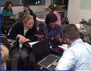
Richard Stockton College of NJ MAED Graduate Students