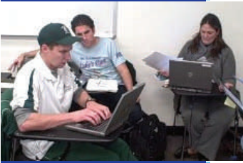
Richard Stockton College of NJ MAED Graduate Students