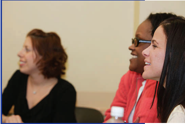
Richard Stockton College of NJ MAED Graduate Students