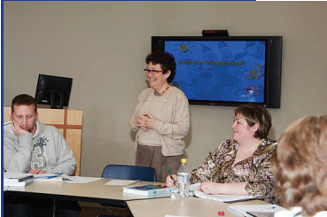
Richard Stockton College of NJ MAED Graduate Students